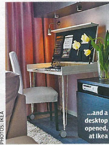
...and a desktop opened, at Ikea