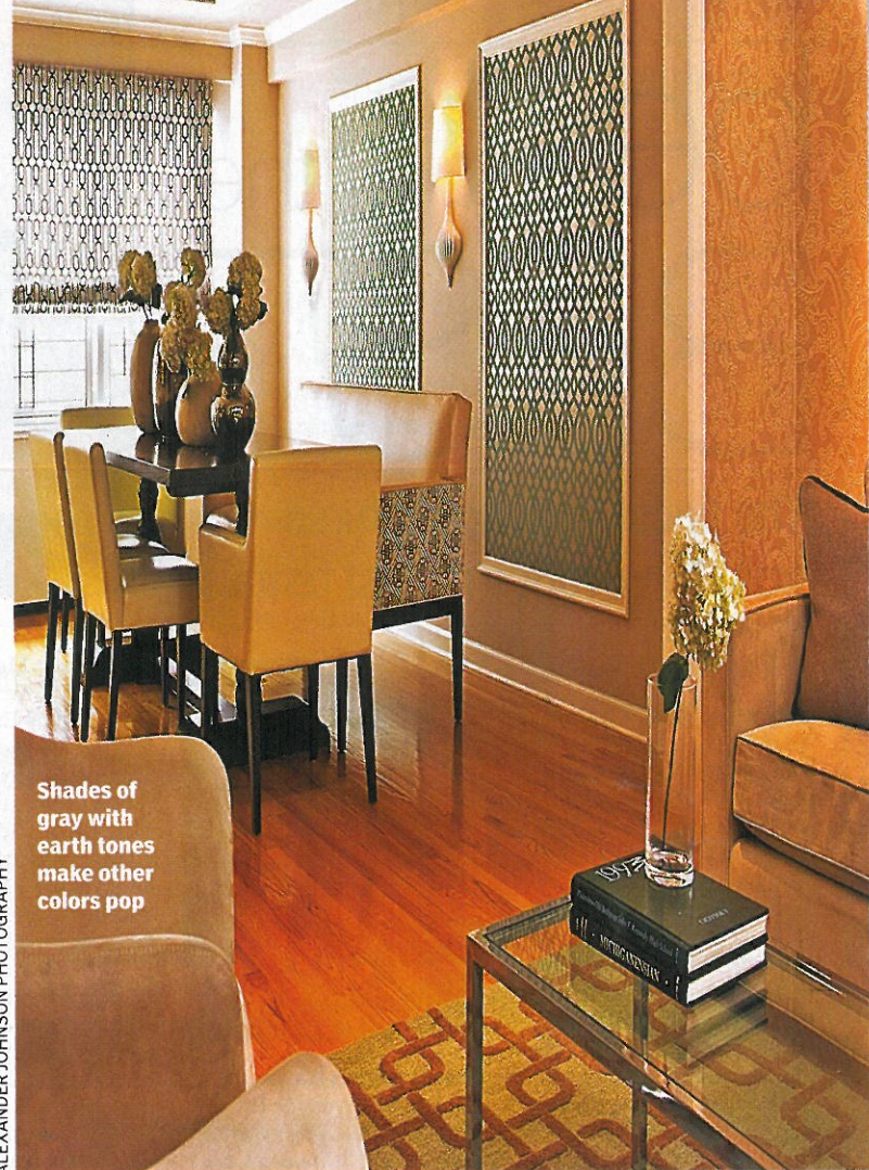
Shades of gray with earth tones make other colors pop

If there is an old side table you no longer like, Vegas calls it an opportunity to play with color. She suggests taking older pieces to an automotive repair place to spray in a bright,