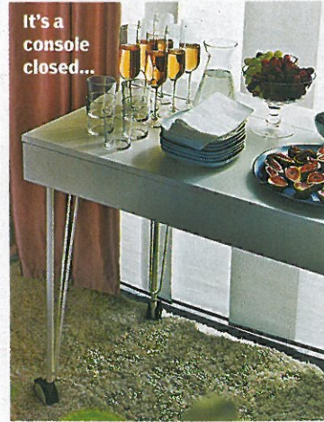
It's a console closed...

Twenty-three percent of renters surveyed by Apartments.com