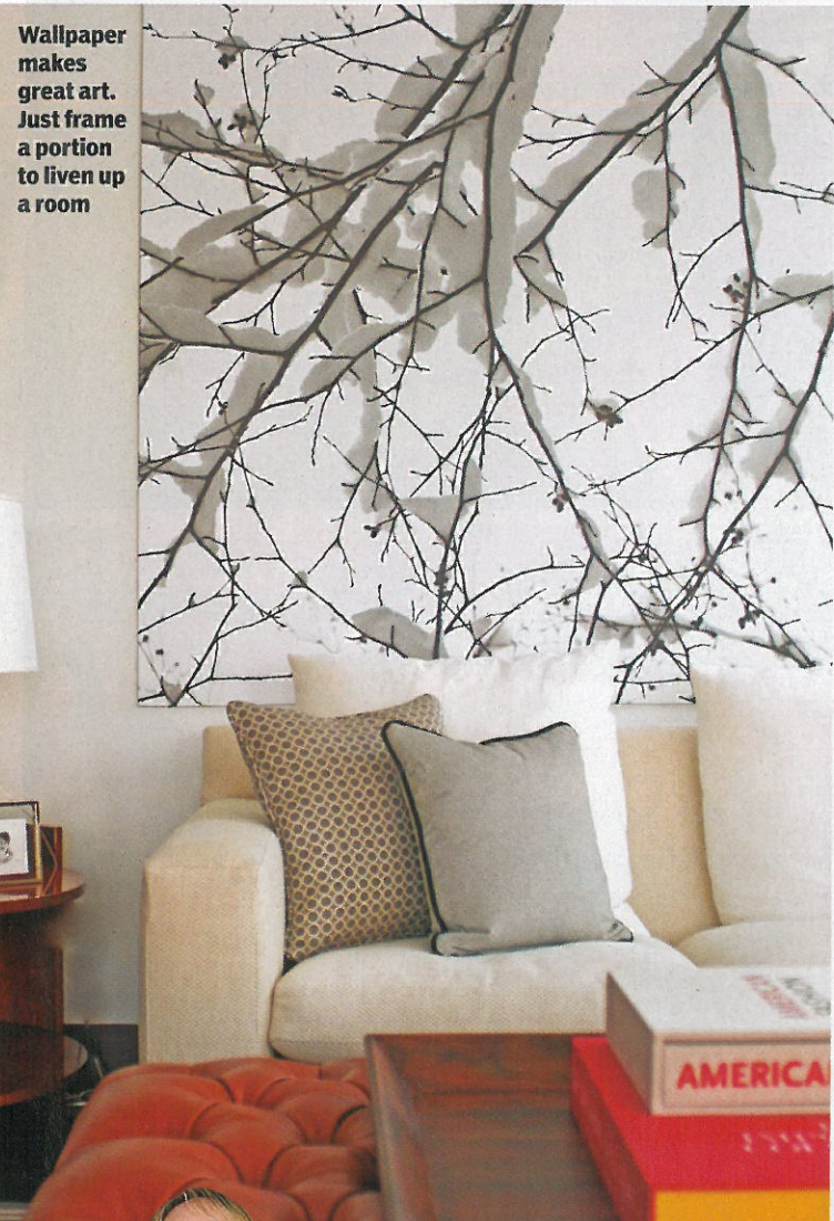
Wallpaper makes great art. Just frame a portion to liven up a room